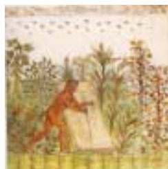
Created by 16 th C. European artist