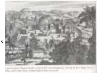
village world versus forest world