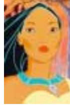
The multiple portrayals of Pocahontas/Matoaka/Rebecca Rolfe (1596?-1917)