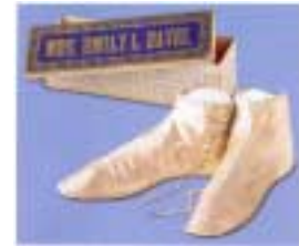
Fancy shoes made in Lynn, Mass.