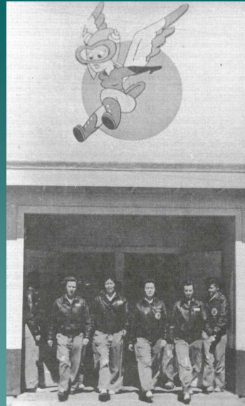
WASP (Women's Airforce Service Pilots)