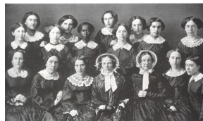
Oberlin College, class of 1855