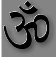
figure itself :: entire universe